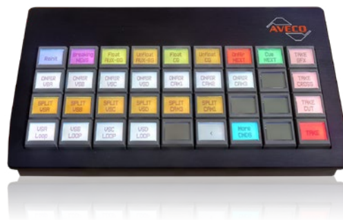
ASTRA Programmable Shotbox Control Panel