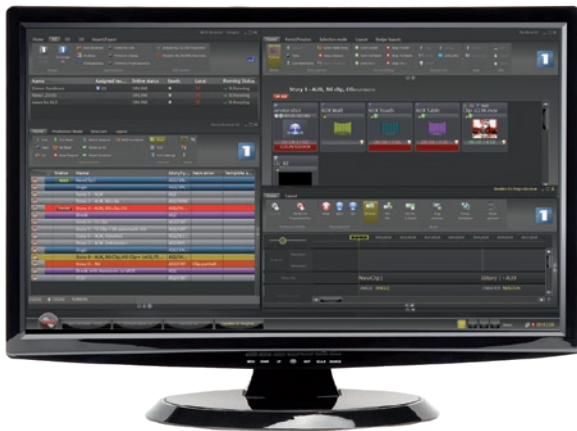
Rundown, shots and timeline