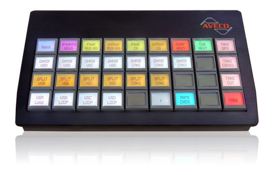
ASTRA Programmable Shotbox Control Panel