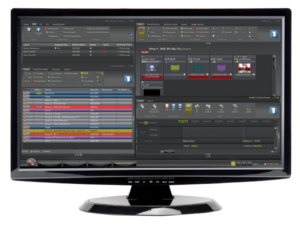
Rundown, shots and timeline